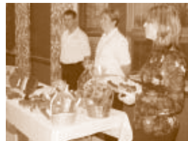
Volunteers at Chocolate Fest 2005

Volunteers work one-and-one-half to three hour shifts and receive a free ticket to the Fest. Shifts begin as early as 8 am and end after closing time with clean-up. Last year, Options had nearly 200 volunteers and their help was invaluable in making Chocolate Fest a great success!